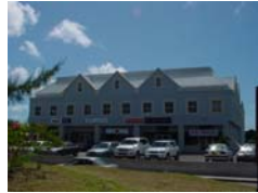
ESSCO, St. Michael, Barbados

Following their recent participation in the "PM Best Practices Seminar" held at the Crown Plaza,