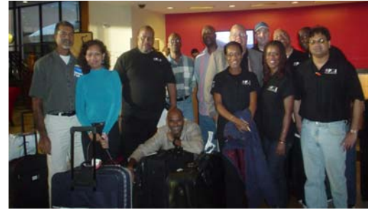
PMI SCC Contingent arriving in Denver